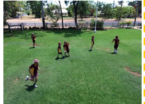
Grounds looking great!