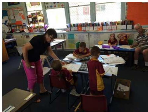
Busy first week of school