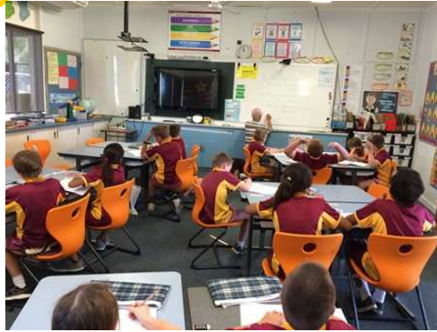
Hard at work